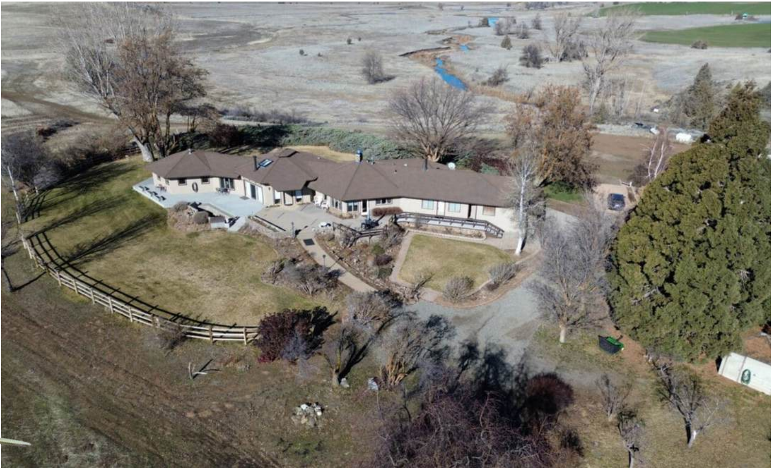
MYSTIC MOUNTAIN RANCH