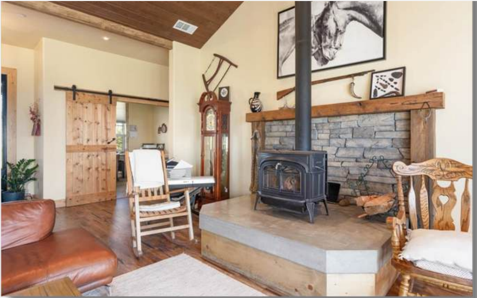
Living area has wood stove on concrete raised hearth with rock and beam accents.