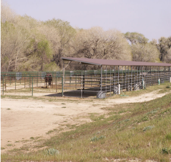
12 outdoor covered stalls