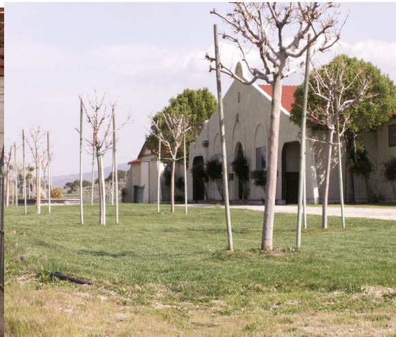
Outside the main barn