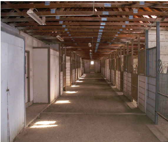
Inside one of the barns