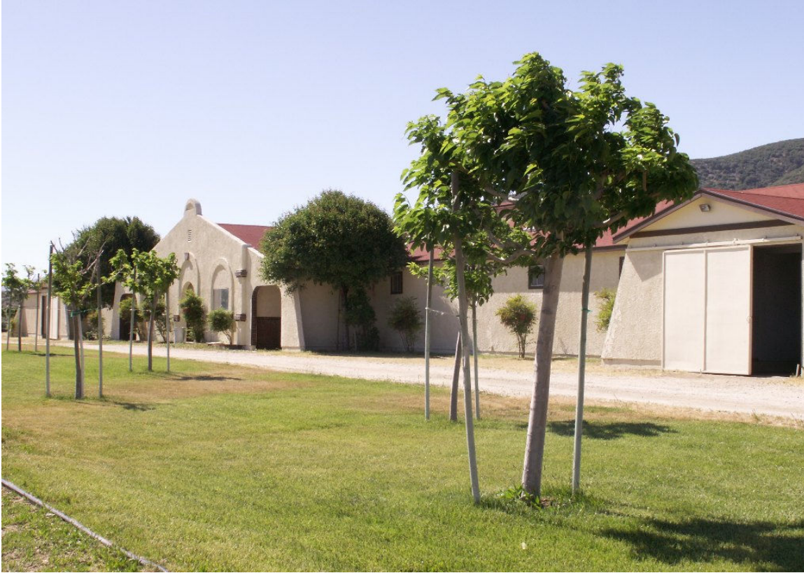
View of main barn looking South West

This is a serious equestrian property with miles of trails and training facilities. There is a nice Spanish style home that is roughly 2000 sq ft that sits above the stables with three bedrooms and three baths, fireplace, custom bar area and a detached two car garage. The other home is a couple hundred yards away. It is 3 bedrooms and two baths and about 1600 sq ft. The main barn has 36 indoor stalls, hay storage, wash racks, indoor lighting, water, two offices with kitchens and tack rooms. Barn #2 has 22 indoor stalls with 3 indoor washing bays, indoor lighting, water, two tack rooms and an outside washing bay. Barn # 3 has 10 indoor stalls, indoor lighting, water, office and an outside washing stall. Barn # 4 has 15 indoor stalls, indoor lighting, water, tack room, outdoor wash rack and horse walker. The covered round pen is sand filled and measures 57 ft diagonally. Above the facilities is a 5/8 mile exercise track. If you are into roping this ranch has one of the nicest roping arenas around the area; all metal construction over 300 ft long, alleys, squeeze chute, header and heeler stations, grand stands, and 4 large holding pens for cattle. There are also 12 covered outdoor metal stalls for your roping guests. This equestrian center has it all and just needs someone to come in and make it happen.