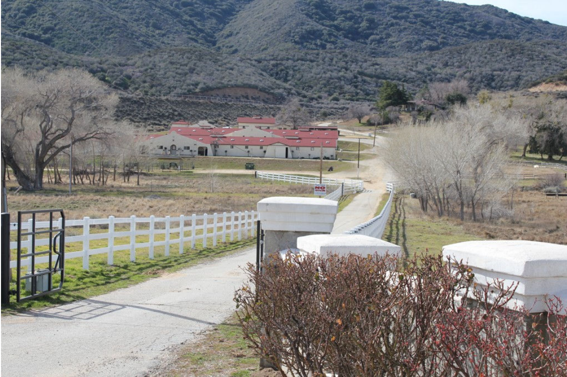
View looking south at equestrian center, 5/8 mile track on top

The property consists of two parcels, 3215-003-001 and 3215-018-012, totaling 78.16 acres and is zoned LCA22.