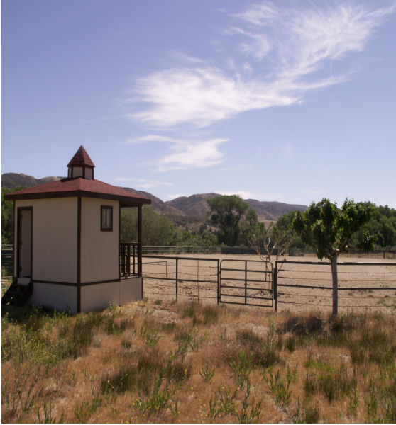
Arena with booth