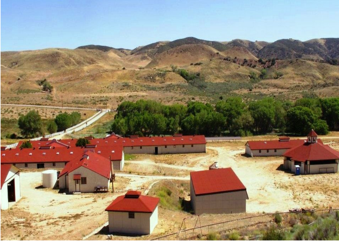
Looking East towards the Petersen Ranch

This 78.16 +/- acre ranch is located in the northern section of Los Angeles County approximate 10 miles west of Lancaster, CA and 20 miles northeast of Santa Clarita, CA. You can leave Beverly Hills in your suit and tie and be on the ranch riding horses in a 1½ hour drive. The Equestrian Center is only 15 minutes from a 7000 ft runway, perfectly capable of handling a Gulf Stream and is only 83 miles from LAX and 68 miles from Burbank airport. The equestrian center in its day was one of the finest in the area. There are 4 Spanish style barns with a total of 83 indoor stalls, plenty of hay storage, office space, apartments, 12 covered outdoor metal stalls, a 57 ft covered round pen, one of the finest all metal 300 ft. roping arena's in the area, with a squeeze chute, grand stands, water and power, and 4 holding pens for cattle. There is also a 5/8 mile track to exercise your horses which the property owns half. The main home is 2000 sq with two caretaker homes. With a little TLC this could be one of the top Equestrian Centers in California.