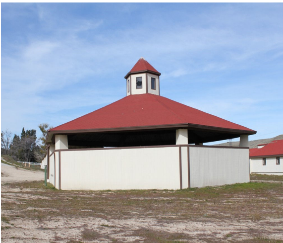
Covered Round Pen