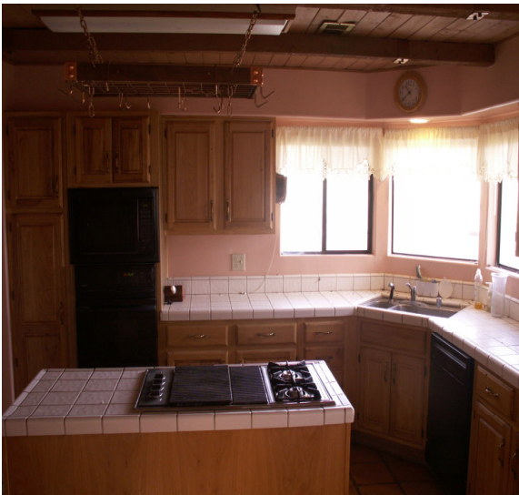
Main house kitchen