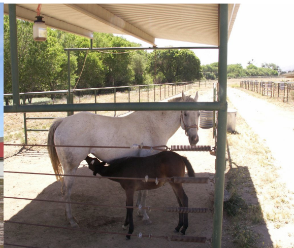
Outdoor covered stall