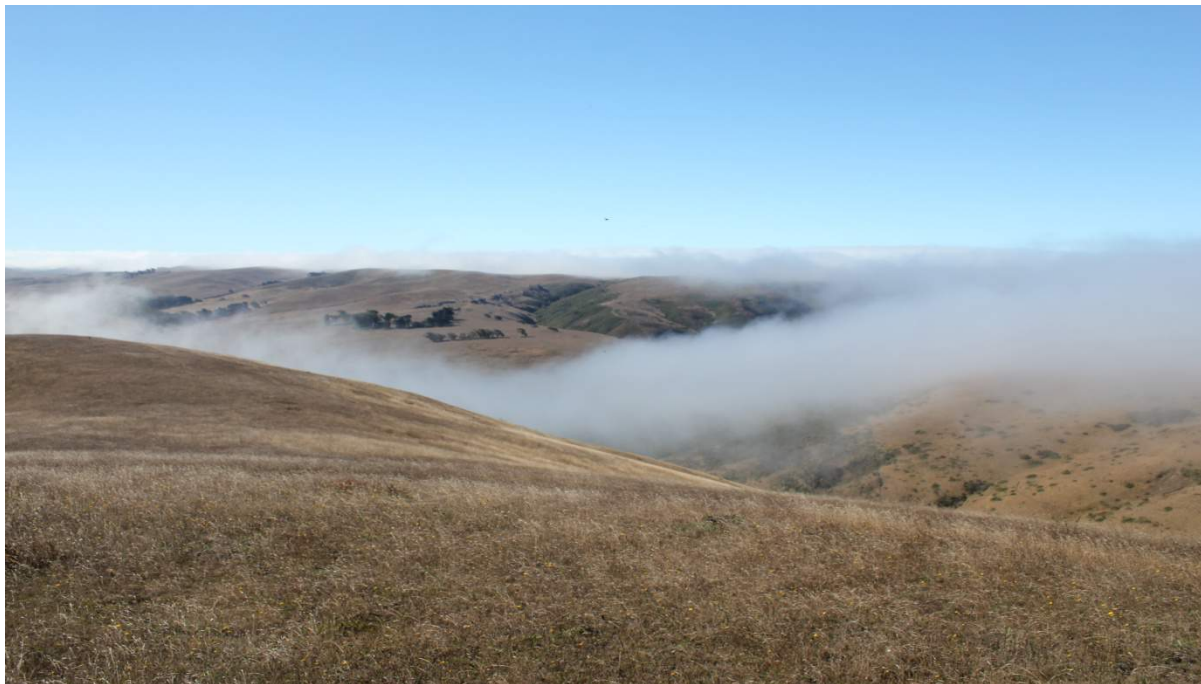
The fog rolling in August 2013