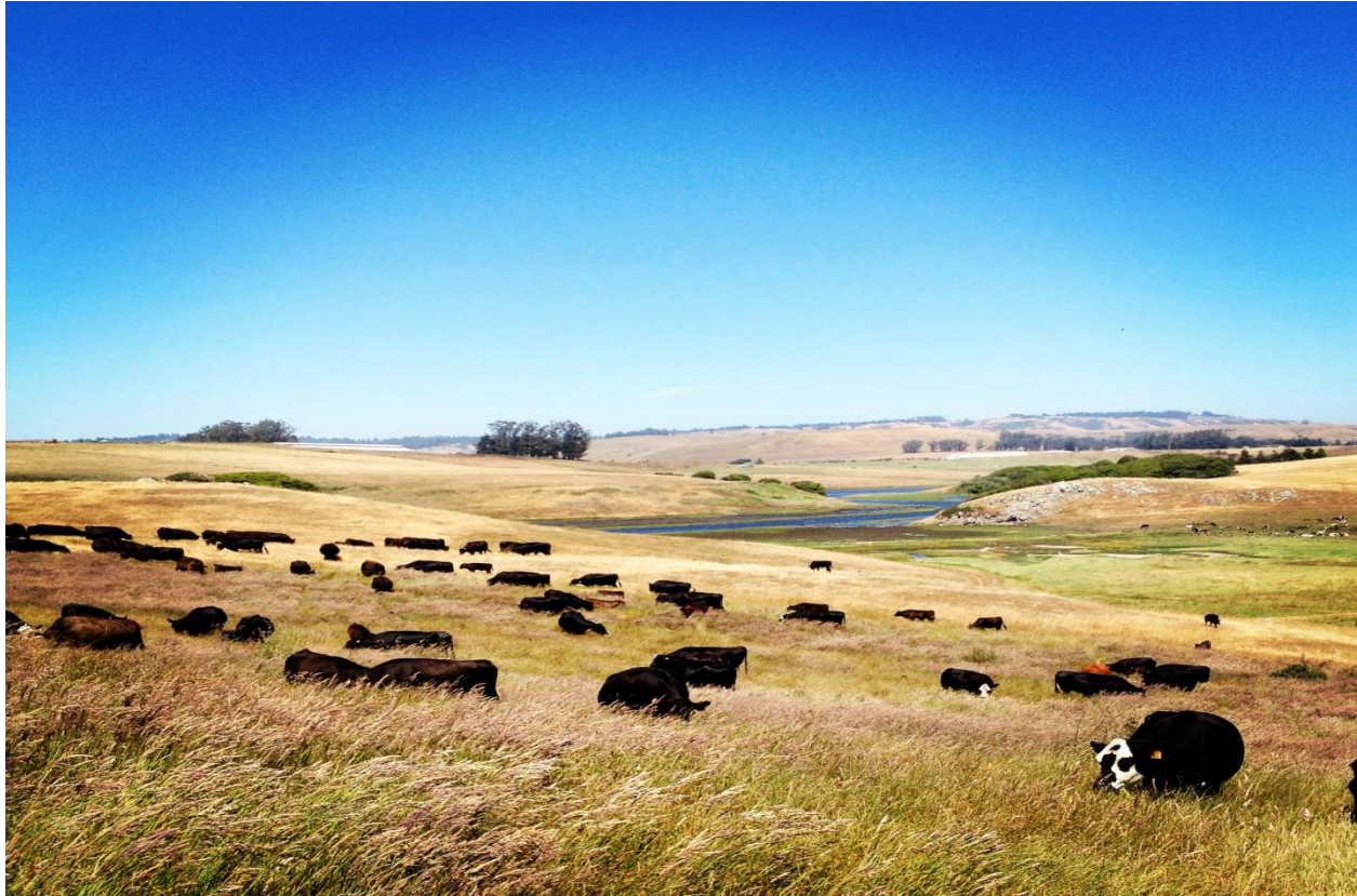
Happy California cows enjoying the organic grass

First time on the market in nearly 150 years, this 1,118±-acre California heritage ranch is one of the oldest in Marin County. It has been in the same family since the 1860's and is annually celebrated at the California State Fair as an example of sound stewardship in agriculture. Because of its unique beauty, the ranch lands have been featured in movies and commercial ads. The ranch has been USDA Certified Organic since 2006, producing Certified Animal Welfare Approved and American Grass Fed Full Blood Registered Beef Cattle, as well as a commercial herd.