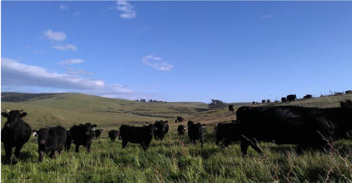
Happy California Cows enjoying the spring weather

The owners have spent a lot of capital upgrading the ranch so that it is USDA certified organic and completely fenced. Over 2/3 of the ranch fencing is new within the last two years by Southwest Fence installing green coat wire and West Texas cedar posts and specialty gates. It has deer fencing and a special pumpkin patch with ingress and egress gates off the county road for school bus visits. The springs, reservoirs and ponds are strategically placed to allow the cattle to move from pasture to pasture to prevent over grazing. Due to the climate and abundance of grass, the cattle graze year round with no extra feed.