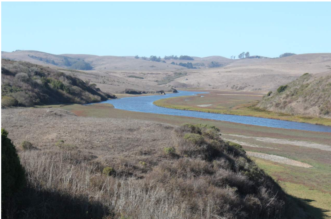
Estero Americano in October 2013