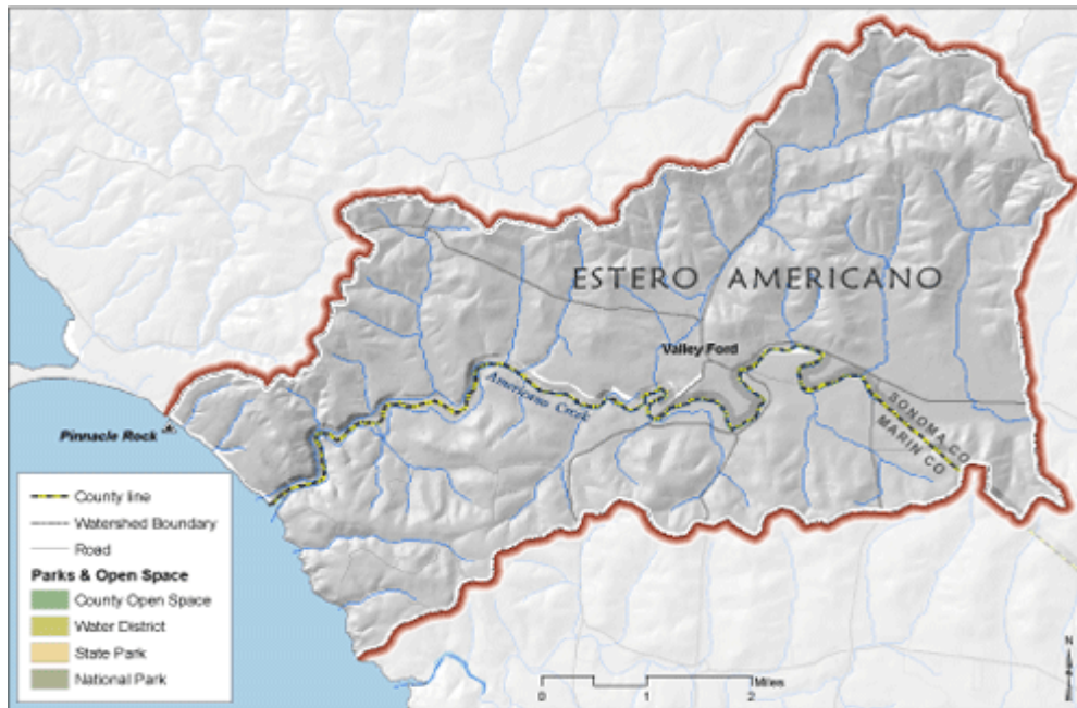
Map of Estero Americano