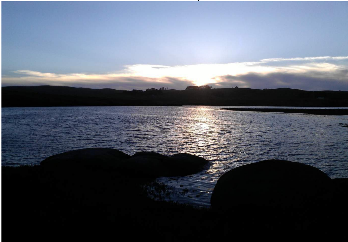
Sun setting on the Estero Americano

The entire ranch is enrolled in the Williamson Act with Marin County.