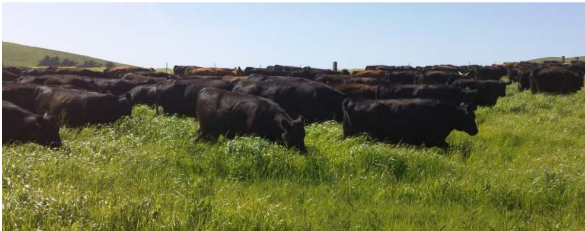
The cows headed west

The 500 head accommodating corrals have a covered hydraulic chute area, weigh scales, vaccination area with power and water, calf table, and medicine refrigeration. The steel beamed barn of almost ten thousand square feet, is actually a recycled Bonny Doon Airport Hangar from Bonny Doon's private access airport in Santa Cruz County, California.