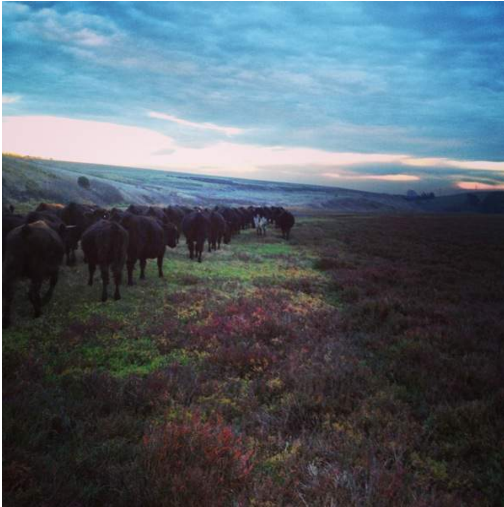
Cows rotating to next pasture