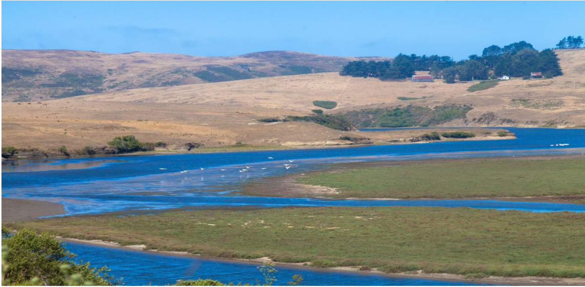
Pelicans on the Estero Americano

Water is on the ranch. 22 natural springs, ponds and reservoirs have been developed for the cattle and wildlife for over 100 years. The present owner has seen photos and infrastructure of ranch roads, reservoirs and natural ponds dating back prior to 1914. The house has a 4-5 gpm well and supplies plenty of water for the main house, lab, garden and processing center.